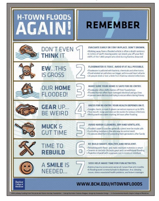
Remember 7 Campaign.