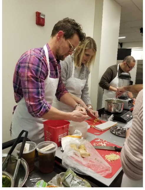
Food as Medicine Wellness Event January 2019